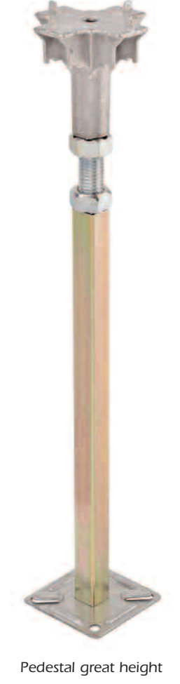
The pedestals are made up of :